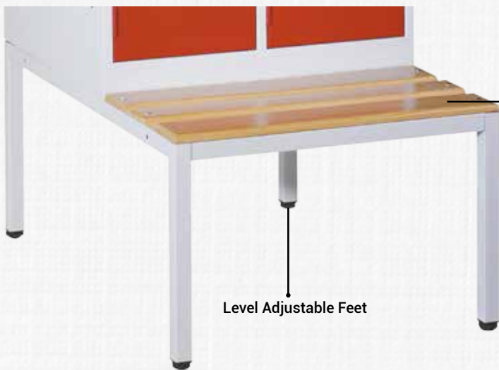
🔍 CHO 60-50