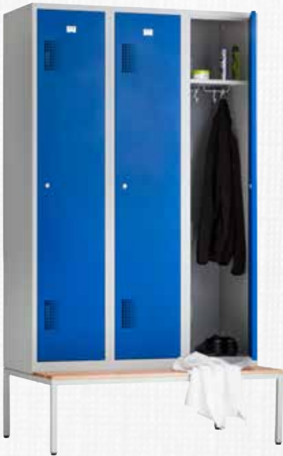
🔍 CHO 80-50