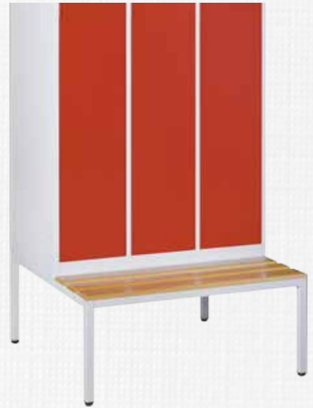
🔍 CHO 90-50