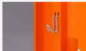
Towel Hook on the Doors