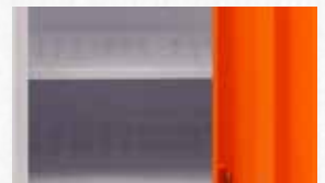
Bottom Shoe Shelf With Holes

On Sides, Tops and Bottoms Are Hole to Be Bolted Together