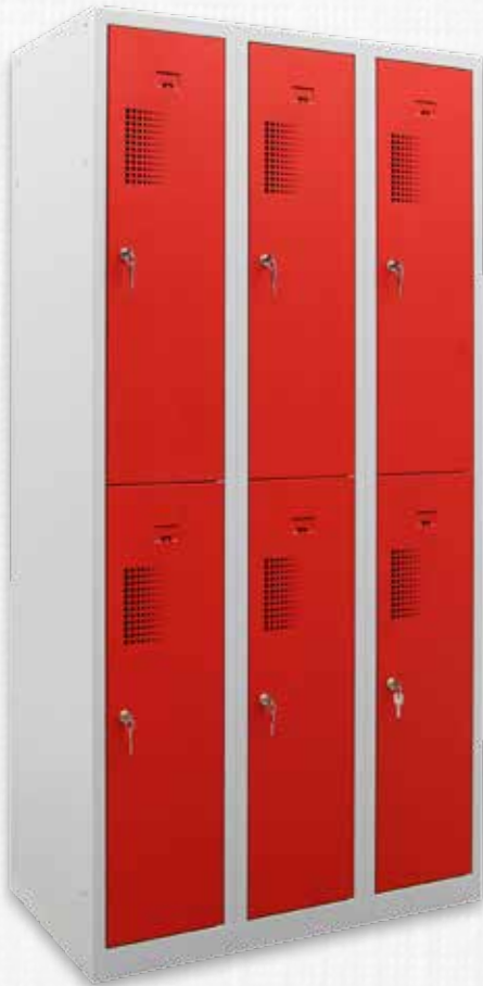
🔍 20 158