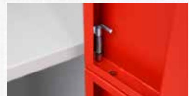
Spring Hinges Doors