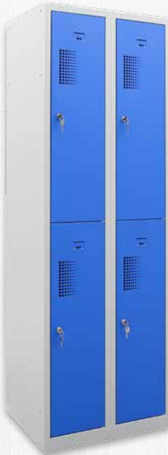
🔍 20 152