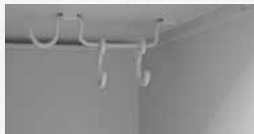
Plastic Clothe Hanging Hooks