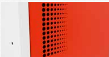
Doors with Special Air Ventilation Holes