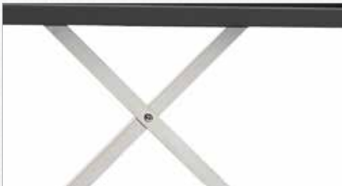
Cross Backside Connection