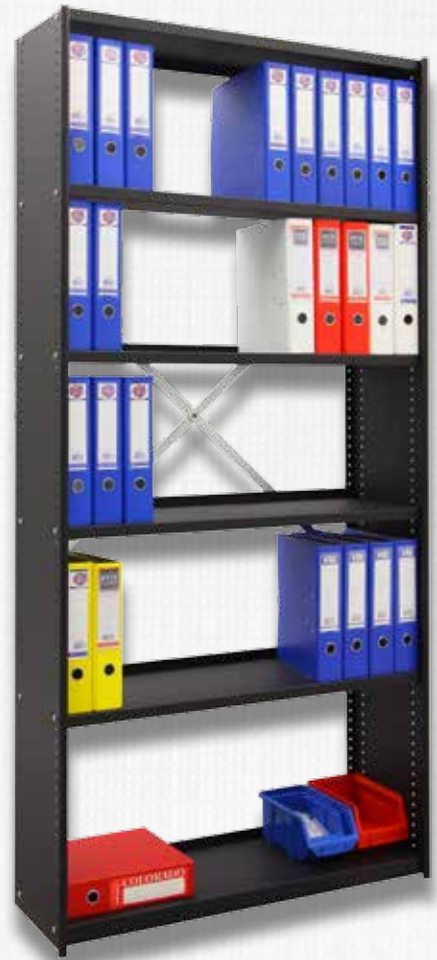
🔍 Extension Unit-97 204