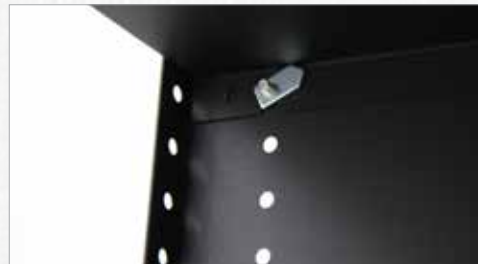
Shelve Fixing System