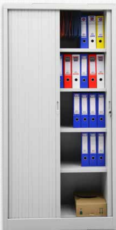
🔍 16 411