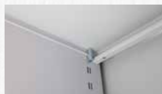
Height Adjustable Shelves in Increments of 21 cm