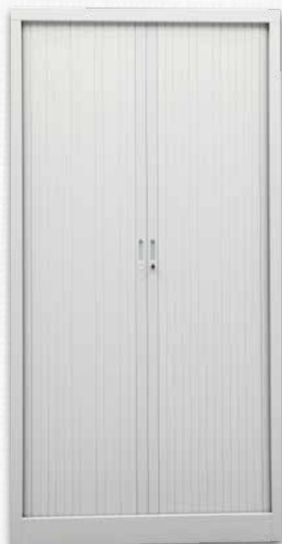
🔍 16 410