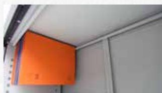
Shelves Are Suitable for Suspended Filing