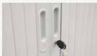
Cylinder Lock with Double Keys